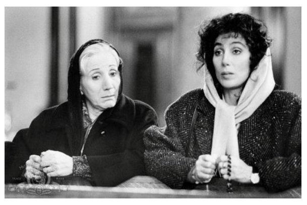
"DELICIOUSLY BUOYANT" RogerEbert.com

Olympia premiered in a global Facebook Live event in July 2020, following a successful international film festival run. The film has been widely praised, including by CBS News, which called it "thoroughly captivating."