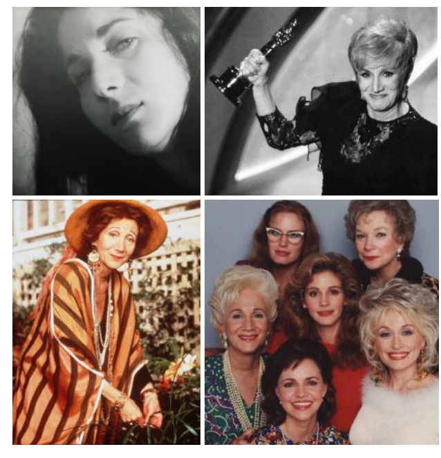
"AN UNCOMMONLY PERSONAL PORTRAIT OF ITS FASCINATING SUBJECT"

As a virtual screening host, we will provide you with the complete Screening Kit, including a private link and password to the film, publicity materials, a discussion guide and other resources to ensure that your event is a success.